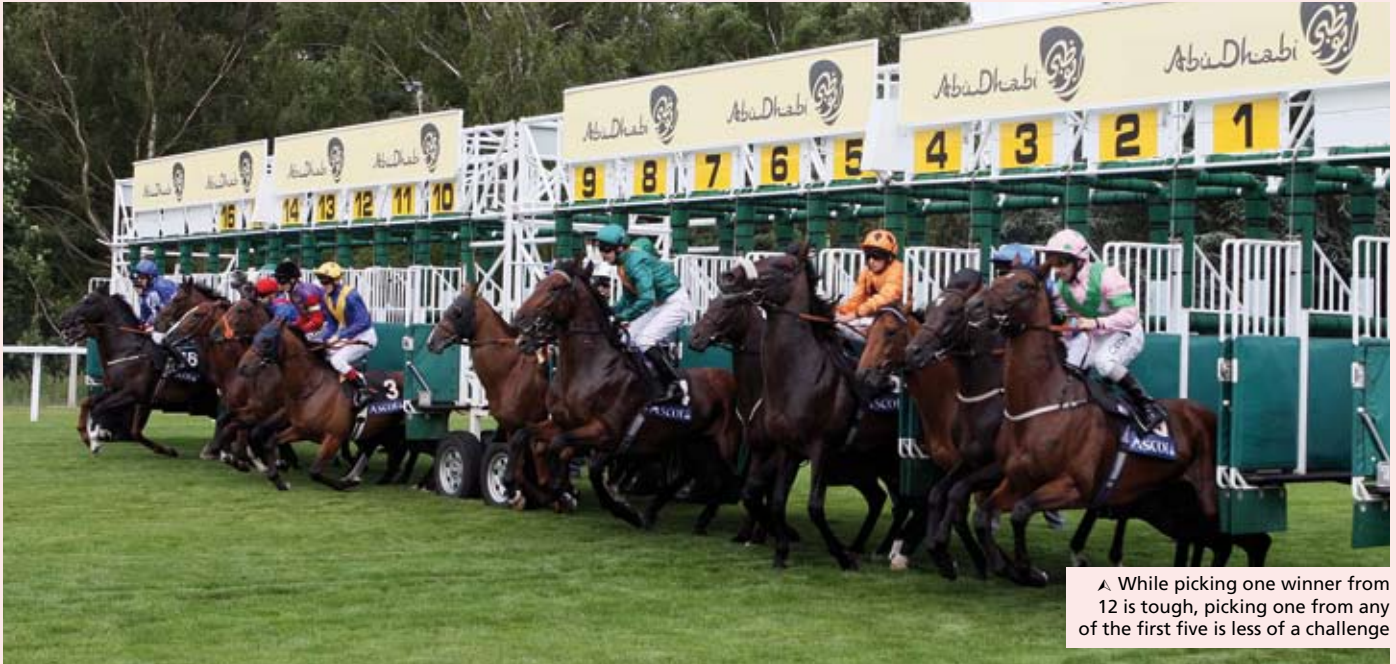
▲ While picking one winner from 12 is tough, picking one from any of the first five is less of a challenge

would win a certain amount if, say, any of the first four selections won. But the calculations required have been complex and this has often proved a barrier to most people. Now, thanks to betting exchanges and software, this strategy is only a few clicks away. If you are still placing normal back bets, consider expanding your repertoire by using this advanced betting strategy.