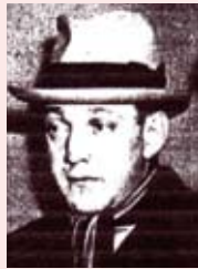
▲ Al Capone's accountant 'Dutch' Schultz is credited with coming up with the concept of 'dutching'

The downside of dutching though, is that you will have to accept a bigger loss if your bet does not win.